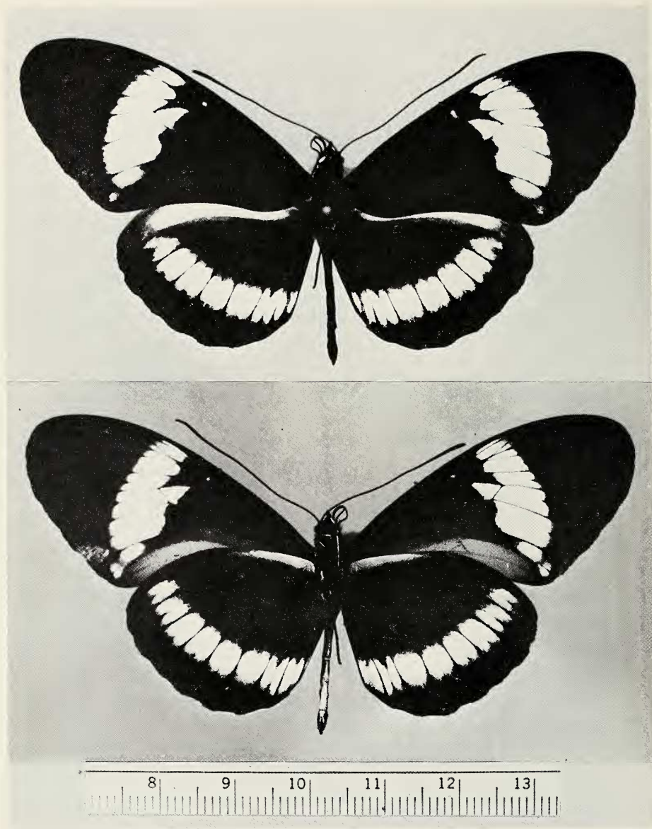
Fig. 1.— Heliconius cydno barinasensis Masters, paratype male, 1000 meters, Barinitas to Santo Domingo Road, Barinas, Venezuela, 5 February 1968, leg: J. H. Masters. A: dorsal aspect. B: ventral aspect. Natural scale.